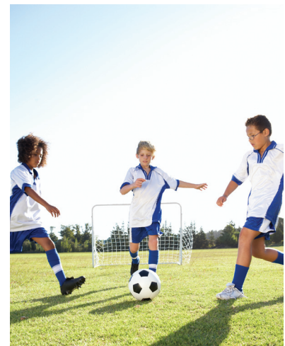
It was great to see kids back on our fields late this summer playing much-loved sports like soccer when the spring session re-started

SWCC is looking for volunteers to step forward to help with our community centre. We currently have openings for: • Ringette Convener • Basketball Convener • Soccer Equipment Managers • Rally Cap/Grand Slam Convener • Softball Convener Please contact the Richmond Site at 204-269-1908 if interested. Registration for several sports also opened in August and continues through this month. Visit www.swcc1.ca for details.